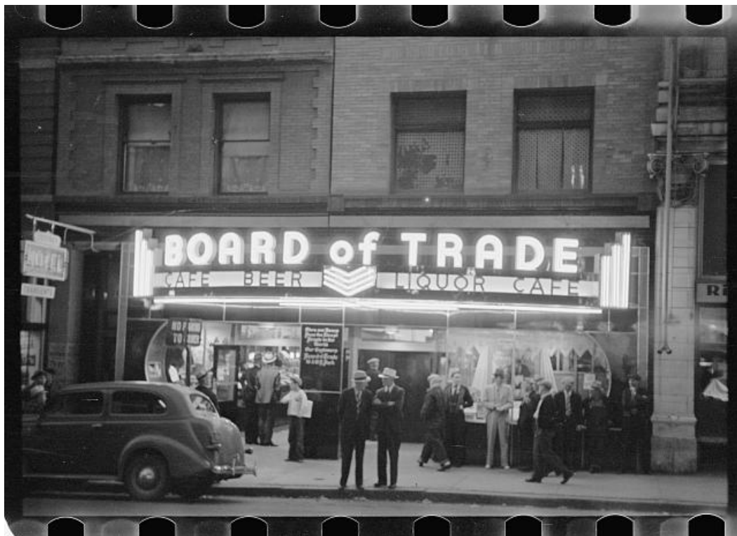
[4] "Bar and Gambling House." Summer 1939. Butte, Montana.