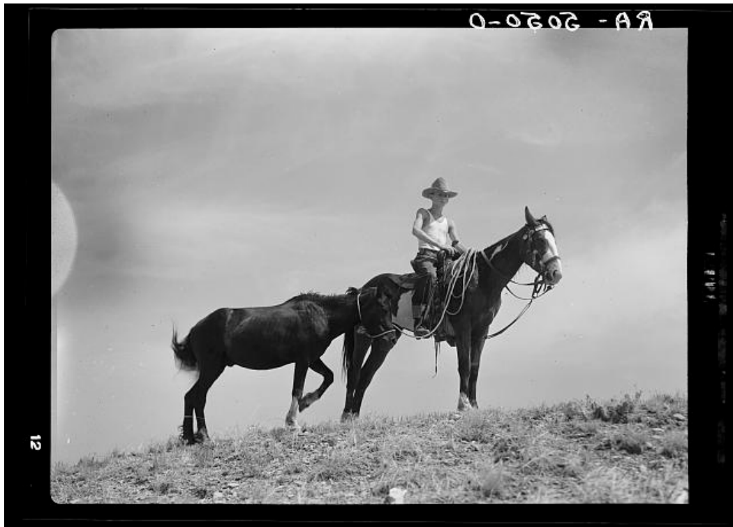
[9] "Son of Montana Rancher near Glendive, Montana." July 1936. Glendive, Montana.