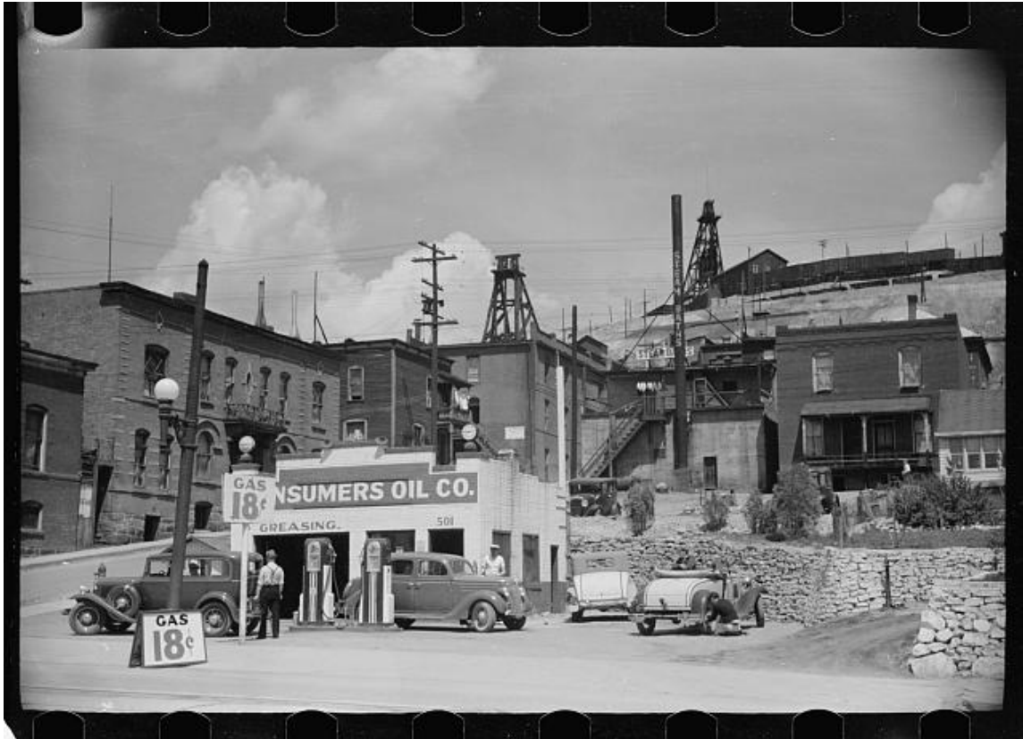
[6] "Gas station, Butte, Montana." Summer 1939. Butte, Montana.