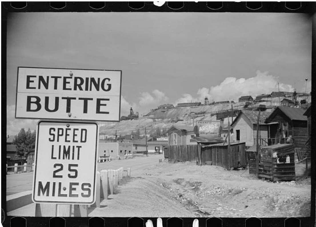
[3] "Entering Butte." Summer 1939. Butte, Montana.