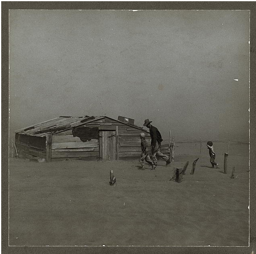
[1] "Farmer and sons walking in the face of a dust storm." April 1936. Cimarron County, Oklahoma.

acceptance of social change, the ability to freely access the Library of Congress' digital images is now more relevant as a document attesting to the FSA project as a historical phenomenon. Its massive digital archive is a testament to the power of a project that largely founded our idea of documentary photography.