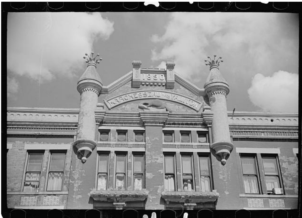
[7] "One of the Oldest Buildings in Butte, Montana." Summer 1939. Butte, Montana.