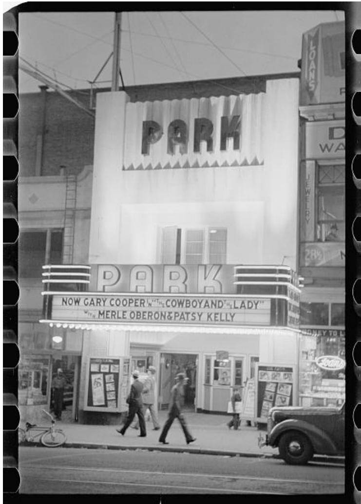
[8] "Moving Picture Theater, Butte, Montana." Summer 1939. Butte, Montana.