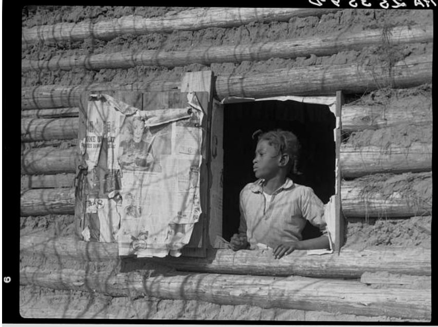
[2] "Girl at Gees Bend." April 1937. Gee's Bend, Alabama.